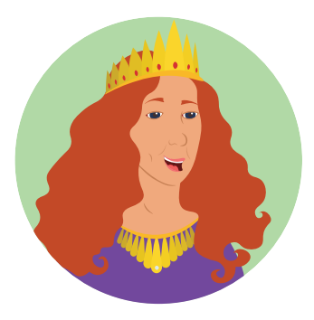
| Queen Esther