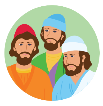
Shadrach, Meshach, & Abednego