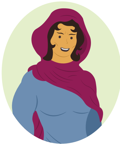
| Woman at the well

These stories tell about a woman, a martyr, and about God's greatest missionary.