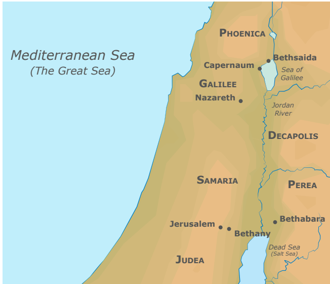
| Bethsaida: Home of Andrew, Peter, Philip, and Nathanael

Nathanael. Nathanael came to Jesus at Philip's invitation. Nathanael is believed to be the same disciple as Bartholomew. When Philip told Nathanael that Jesus was the One about whom Moses and the prophets had written, Nathanael was skeptical . He asked (John 1:46), "... Can any good thing come out of Nazareth?" Philip answered, "Come and see." These words of Philip are the invitation of the New Testament to everyone: "Come and see." The Psalmist wrote (Psalm 34:8), "O taste and see that the LORD is good ..." Those who come to Jesus by faith will find Him a wonderful Saviour. Nathanael's words of faith in Jesus were these (John 1:49), "... Rabbi, thou art the Son of God; thou art the King of Israel."