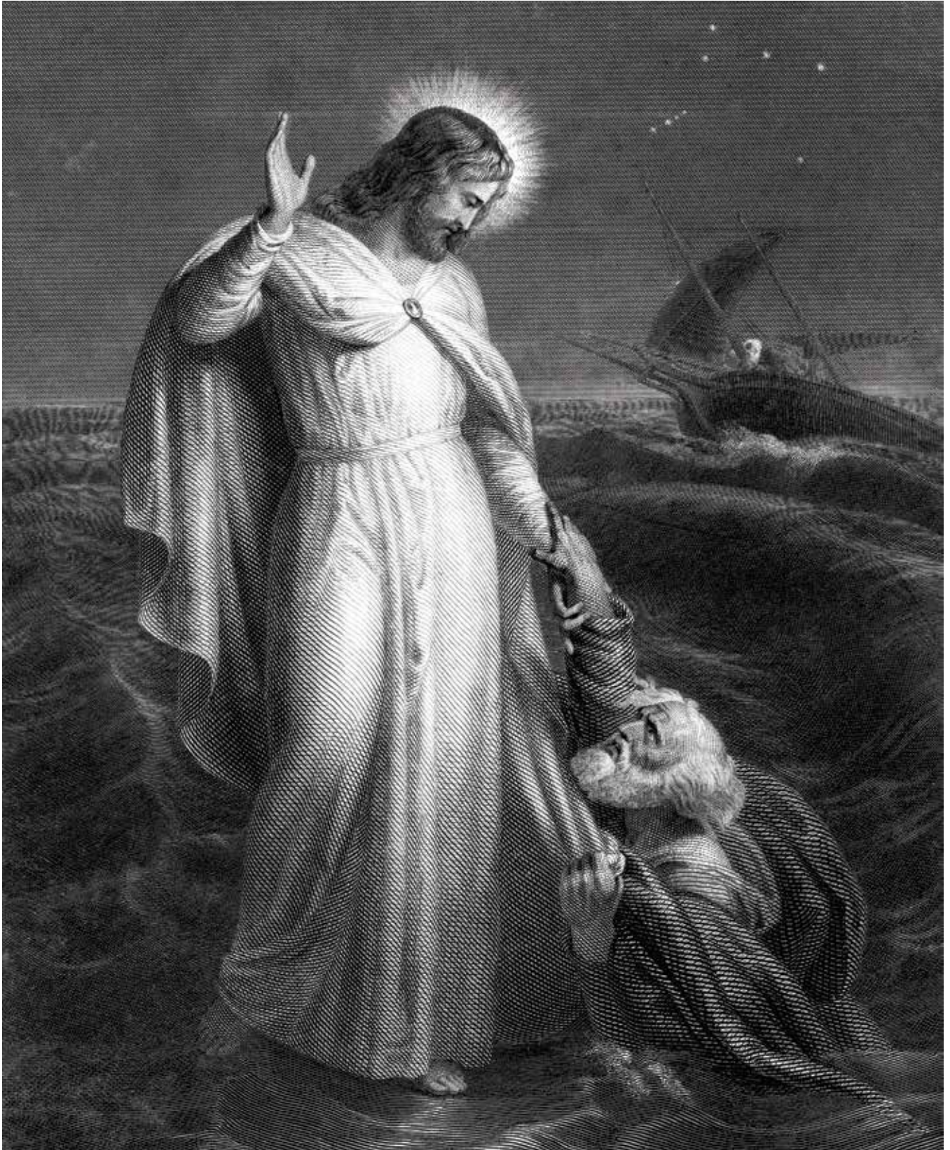
| Jesus walking on the water