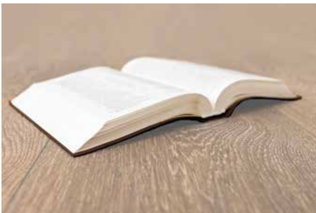
| The Word of God

Written guidance. Almost every item of any complexity purchased today comes with an owner's operation manual which often includes repair instructions. God's Word is His operation and repair manual for man's own well-being on the earth. Since God created mankind, He knows how men should live and operate for maximum enjoyment of life and for His glory.