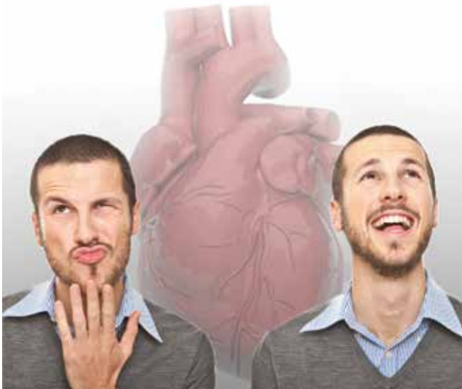
| The Deceitful Heart

Evil desires. God's Word tells us (Jeremiah 17:9) that, "The heart is deceitful above all things, and desperately wicked: who can know it?" The Psalmist said (Psalm 139:23-24), "Search me, O God, and know my heart: try me, and know my thoughts; And see if there be any wicked way in me, and lead me in the way everlasting." Even after a person is saved from the penalty and power of sin, he is not yet removed from the presence of sin. The apostle Paul stated that he battled continually against sin in his members which caused him many times to fall short of perfect obedience to the law of God.