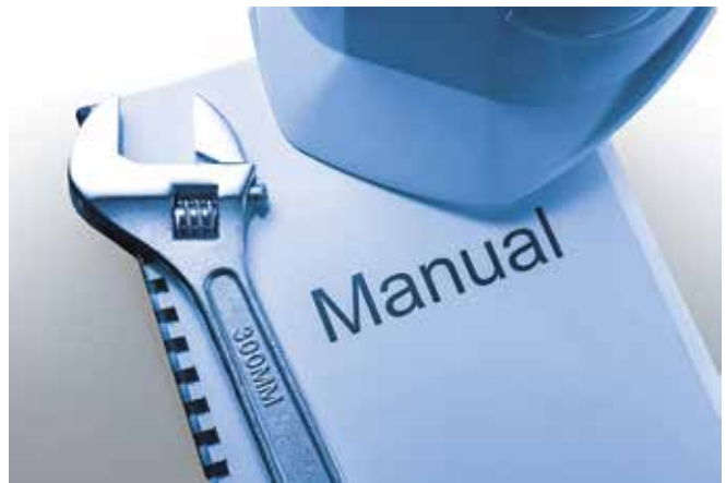
| Owner's Manual

Personal guidance. God has stated in His Word that there is much safety in seeking guidance through counselors. Often the advice of more than one person is necessary to be assured of unbiased counsel. Safe counsel can be gained by choosing several Christians who are spiritually mature and whose opinions are