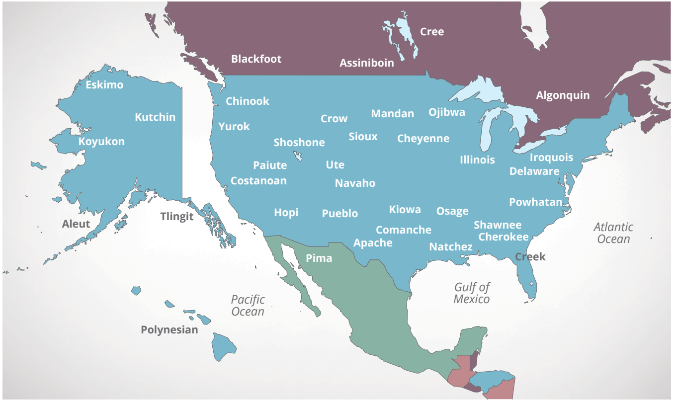
| Some of the Major Tribes of Native American Indians