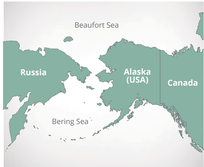
| Alaska and Russia at Bering Strait

After the northern glaciers began to melt and the climate became warmer, many of the larger animals became extinct ; and the people began to hunt smaller animals. Consequently, they did not need to travel great distances to hunt; and groups could camp in different places. Whenever a group camped, the nomads learned to use the natural resources of the region.