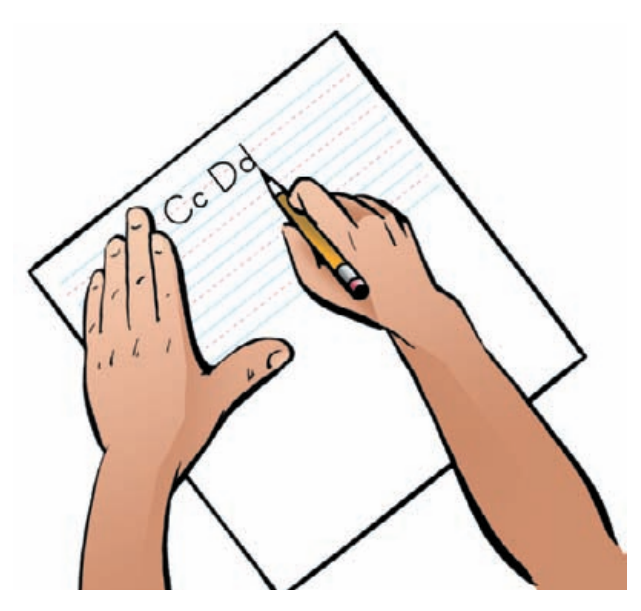
Correct Right-Handed Position

Paper is placed on an angle to the left. Left hand steadies the paper and moves it up as you near the bottom of the page. Right hand is free to write.