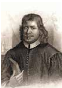
| John Bunyan

Note: All vocabulary words in this LIFEPAC appear in boldface print the first time they are used. If you are not sure of the meaning when you are reading, study the definitions given.