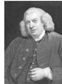
| Samuel Johnson