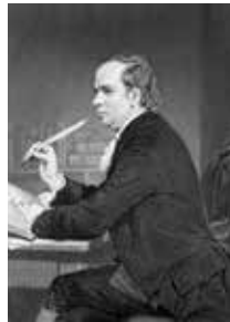
| Oliver Goldsmith