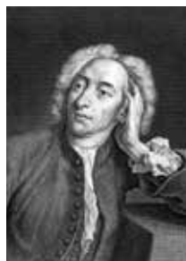
| Alexander Pope