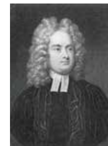
| Jonathan Swift