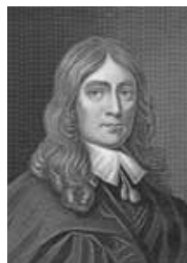
| John Milton